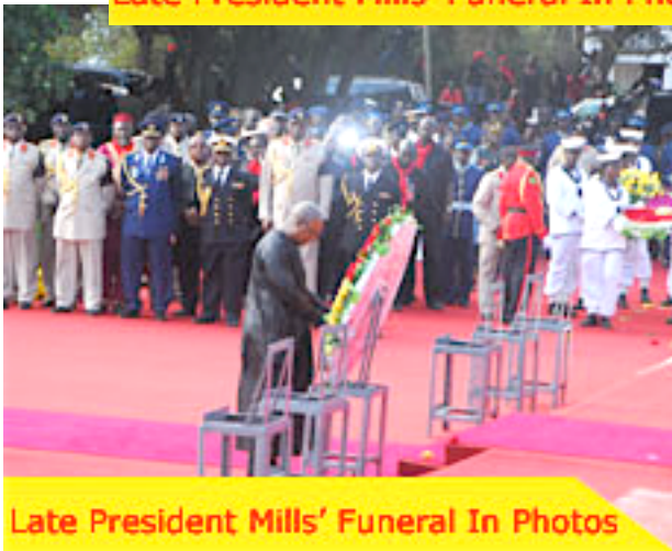
Late President Mills' Funeral In Photos