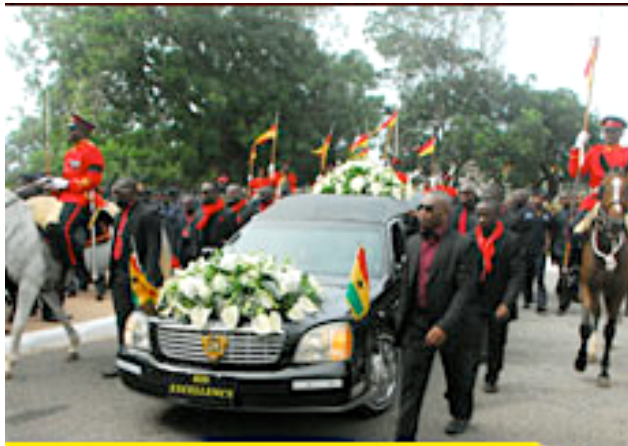
Late President Mills' Funeral In Photos